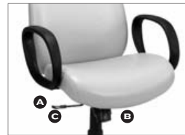
6 - CENTER PIVOT TILT