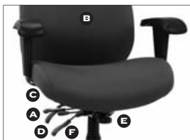
4 - SYNCHRO TILT